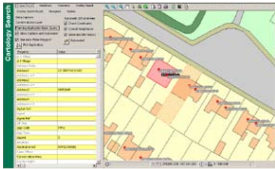
Cartology search - FastSUITE'S embedded GIS