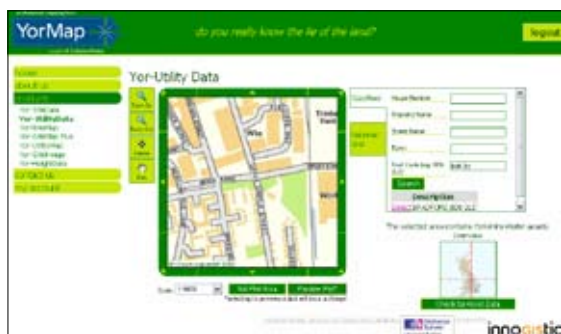
Utility data on-line at Yorkshire Water