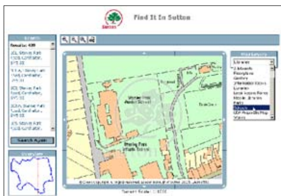
Public service information on-line at the London Borough of Sutton