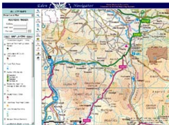
Local development framework website at Eden District council